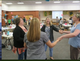
Teachers learning in summer training