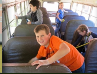
Students serving others